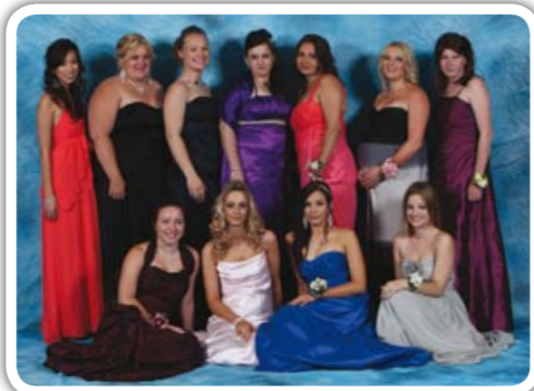
Belles of the ball: 2011 student's achievements are celebrated at the annual Trinity Learning Centre ball.

The event was attended by the students, trainees and respective partners, as well as staff and Board from UnitingCare West and the Schools of Isolated Distance and Education, program volunteers and Uniting Church congregation members.